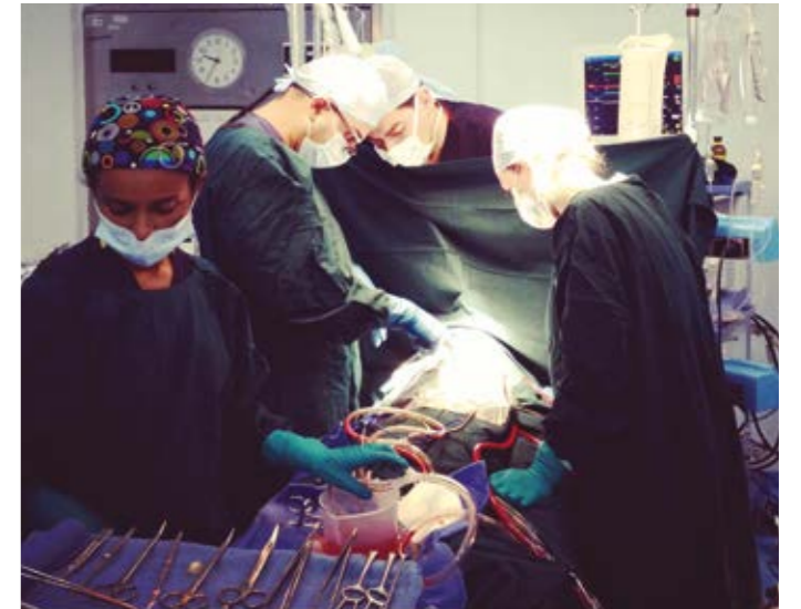
Operating Theatre at the Aswan Heart Centre

Today, under the management of the Magdi Yacoub Heart Foundation, the AHC has grown to be a centre of excellence for the region. Chain of Hope now refers children from African countries to AHC for treatment, and in 2013 partnered with the AHC staff to conduct a mission to neighbouring Ethiopia. Led by Chain of Hope President and Founder Sir Magdi Yacoub, the mission treated 25 children and collaborated in the ongoing training of the Ethiopian team.